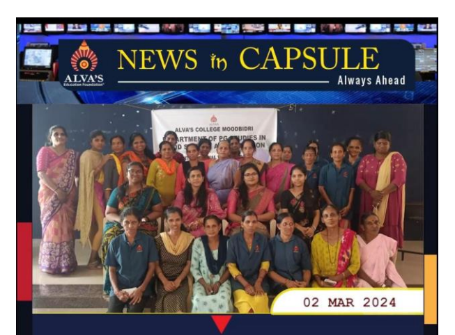
ಆಳ್ವಾಸ್ ಕಾಲೇಜಿನ Food Science and Nutrition ವಿಭಾಗದ ವತಿಯಿಂದ ಆಳ್ವಾಸ್ ನ ಶಿಕ್ಷಕೇತರ ಸಿಬ್ಬಂದಿಗಳಿಗೆ ಆರೋಗ್ಯ ತಪಾಸಣೆ ಮತ್ತು ಸಮಾಲೋಚನ ಕಾರ್ಯಕ್ರಮ