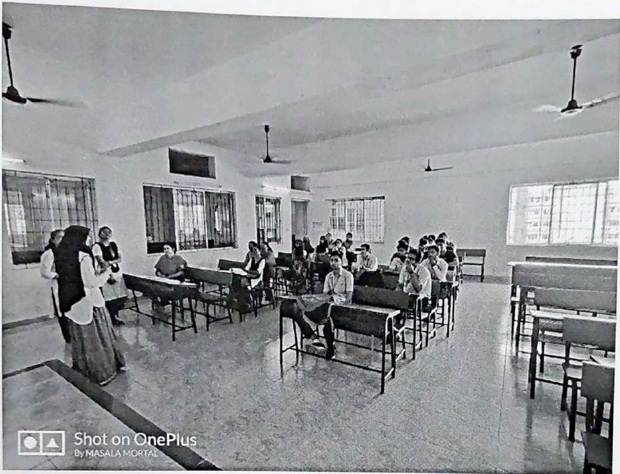
English Forum in pictures: