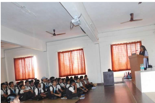
Awareness on Common epidemic diseases