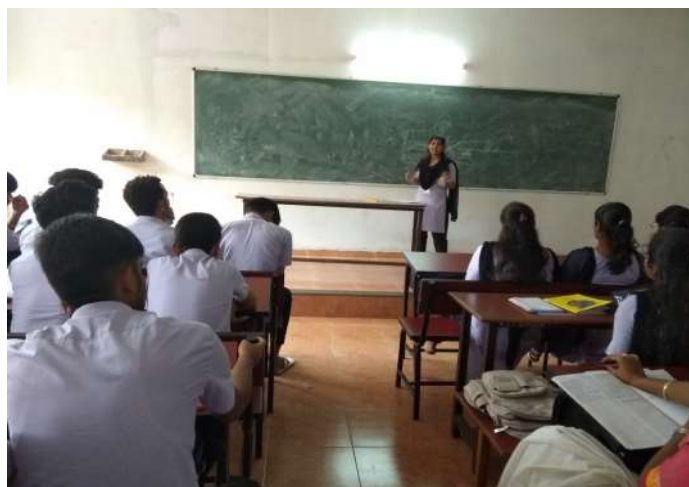
Second year students engaging the classes for first years

To enhance the confidence and communication skill of the students, interclass exchange program was organized on 17-09-2019. Class was held by the second year microbiology students for first years.