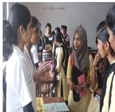
Final year microbiology students giving hands on training to P.U.C. students.