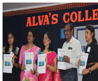
Releasing of MICROBIAL OUTLOOK