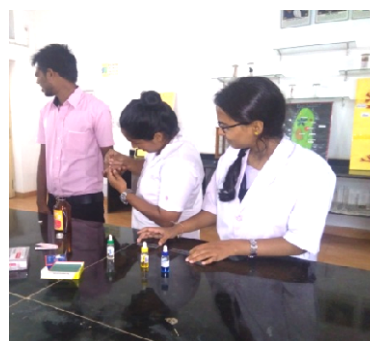
Students performing bloodgrouping