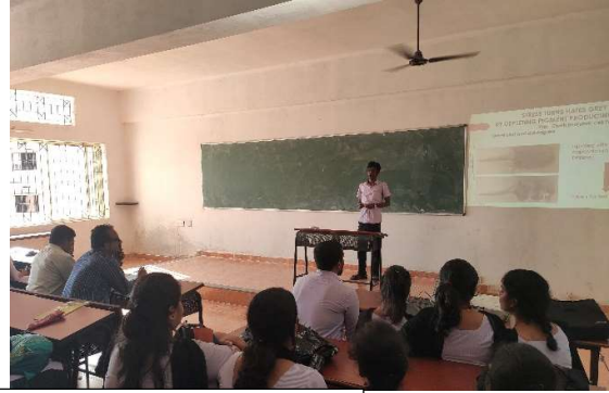
PPT presentation by the participants