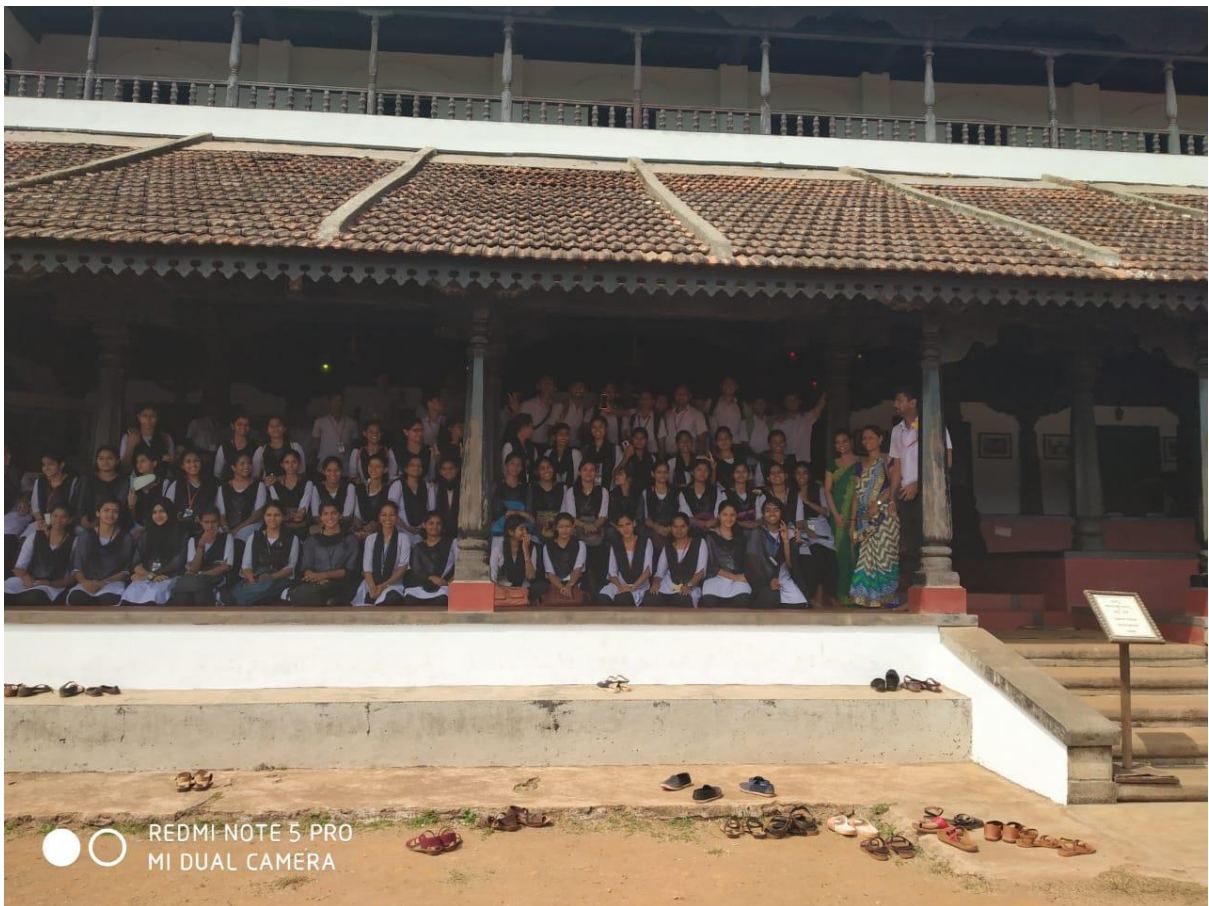
Alva's first year B.sc students in front of Guttu house