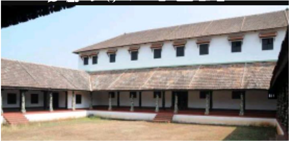
This is overview of Guttu house