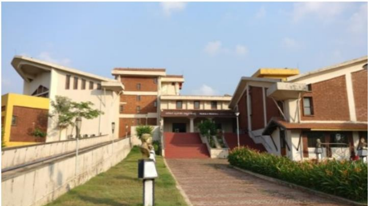
OVERVIEW OF PILIKULA REGIONAL SCIENCE CENTRE

The Pilikula Regional Science Centre (PSRC) in Pilikula, Mangalore was set up jointly by the department of Science and Technology. The Science Centre is set up in an area of about 10 acres, having a built-up area of approx. 4000 sq.m. it houses 3 exhibition galleries, a temporary exhibition hall, an inflatable dome planetarium, a 3D theatre facility, library, conference hall, computer room, a small workshop for maintenance of exhibits and public facilities.