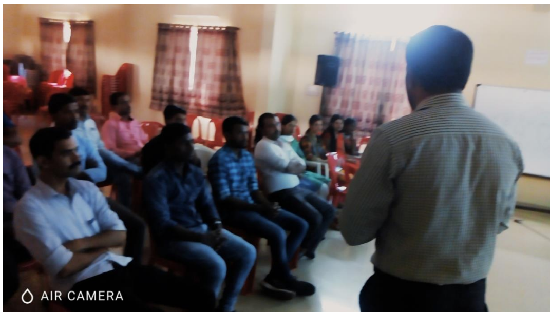
Session on Importance of counseling and Follow-up