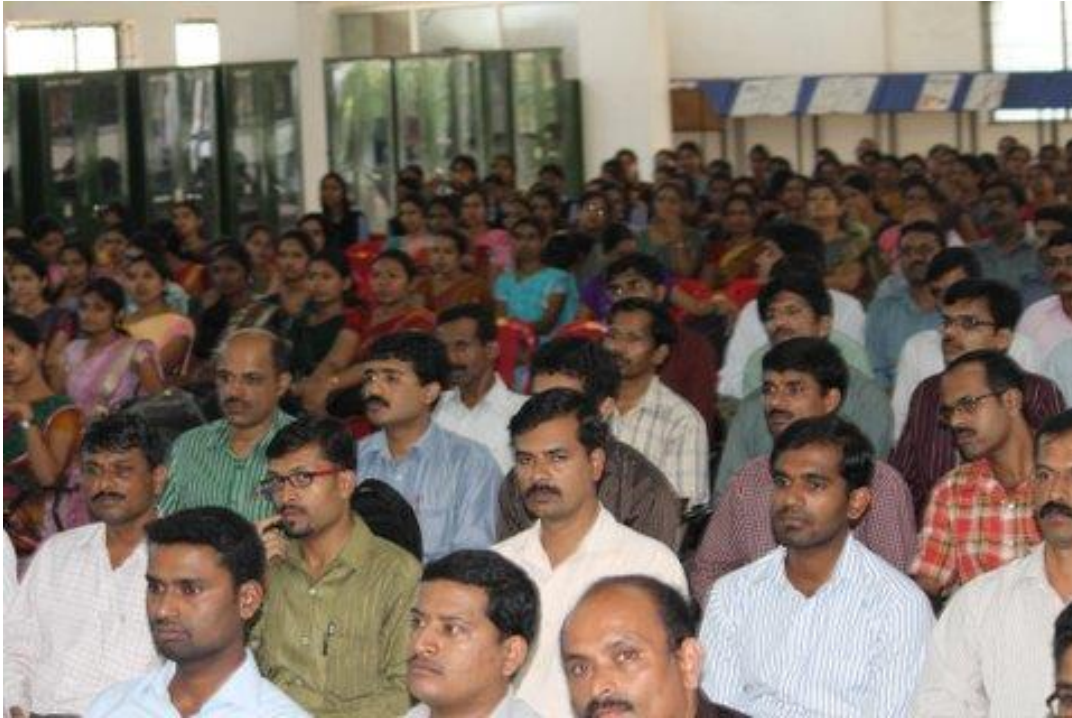
Beneficiaries of the Technical Session- Staff, Alva's Pre- University College, Moodbidri.

Wardens training on “adolescent issues and coping strategies”