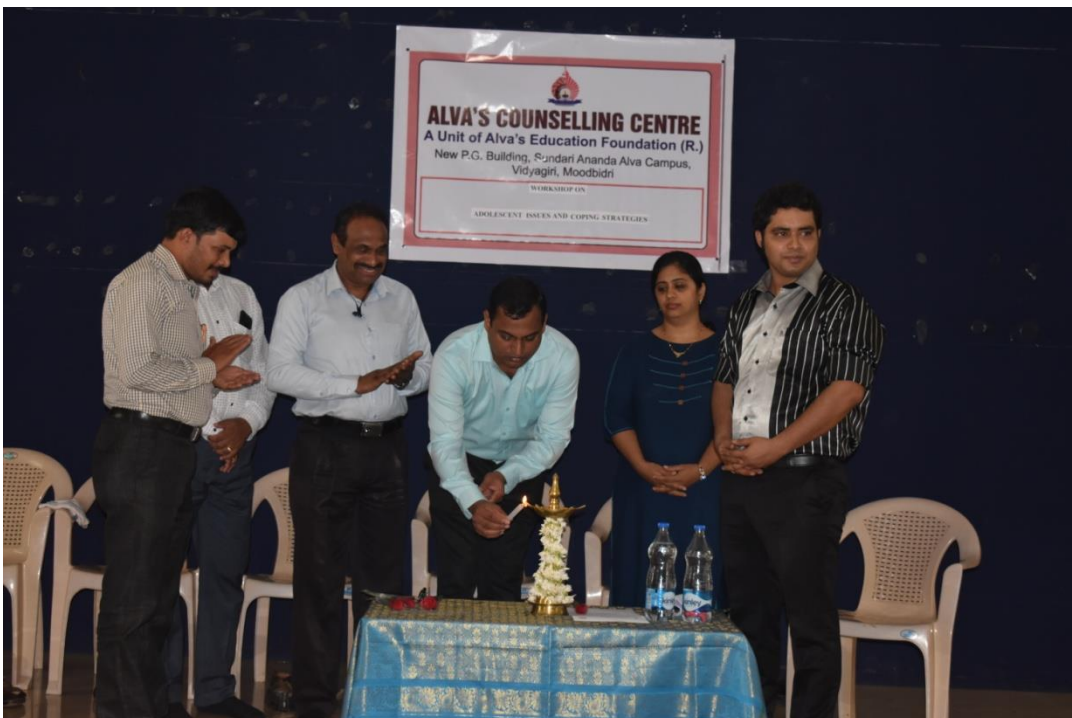
Date:4/6/2018 Venue: Puttanna Kanagal Seminar hall, new P.G. building

Wardens training on “adolescent issues and coping strategies”