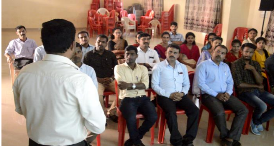
Introductory session on adolescent Mental Health

Venue:PuttannaKanagal Seminar hall 3 rd Floor, New Pg. Building, Vidyagiri,Moodbidr .