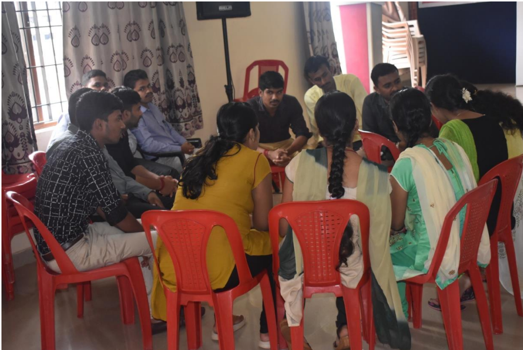
Group activity by the wardens