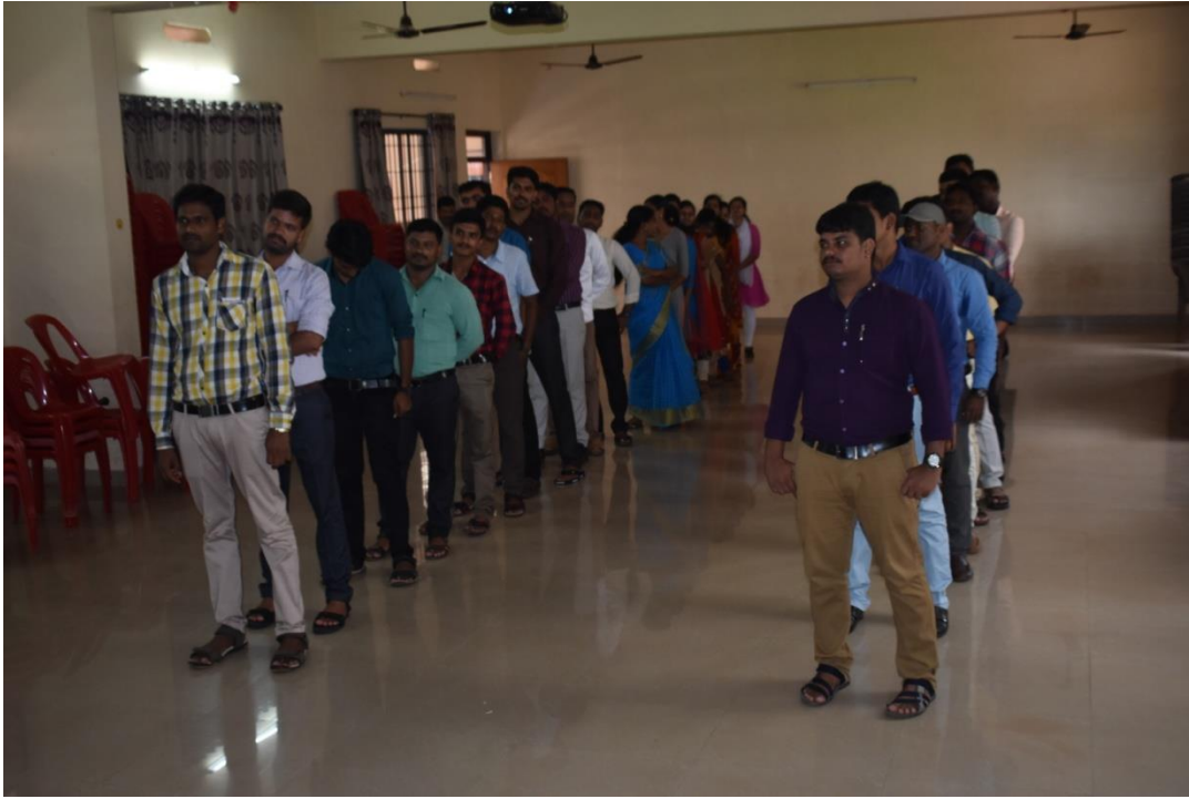
Ice breaking session to warden