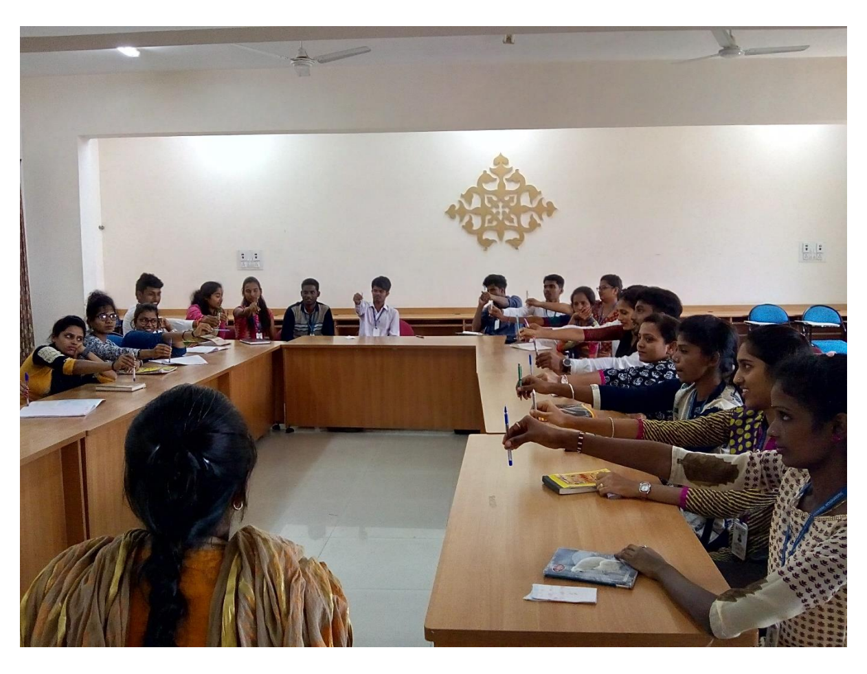
Activities on skill development