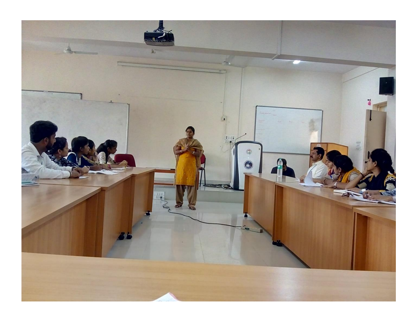
Session on the organisation & its functions.