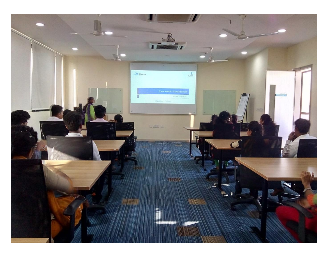
Session about CSR activities of Quess