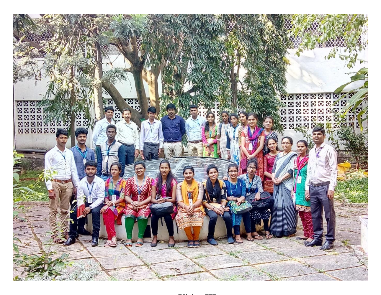
Visit - III