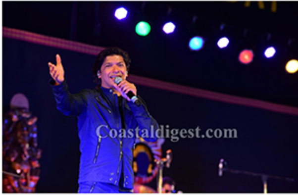
Shantanu Mukherjee also known as Shaan performing on the 3rd day of Alva's Virasat 2016.

The crowd went on enjoying the performance and cheering him throughout his performance making it the show stealer of Alva's Virasat 2016.